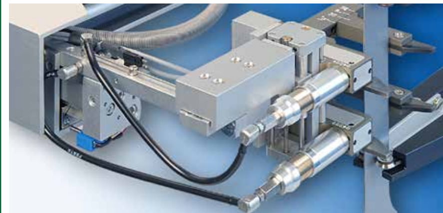
Figure 1. Close-up of follower arms on AE300 and transverse AE extensometers on specimen.

Compatible With Tinius Olsen Electromechanical and Hydraulic Tension and Compression Testing Machines